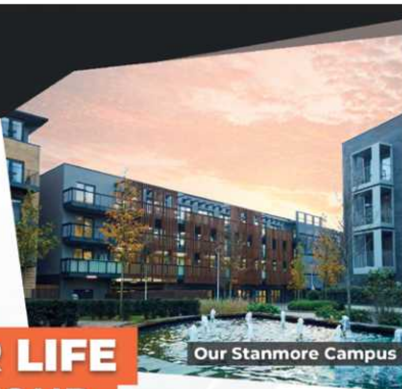
Our Stanmore Campus